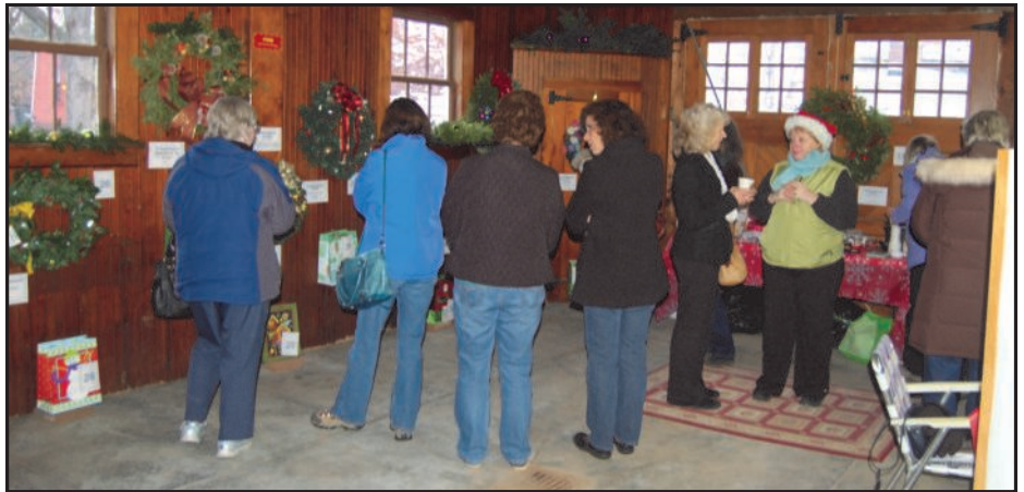
Visitors enjoy the 2012 Festival of Wreaths

We invite you to come mingle with others over some holiday treats, wear your holiday sweaters, share some holiday stories with acquaintances old and new, and help us continue to build this new holiday tradition in Portland.