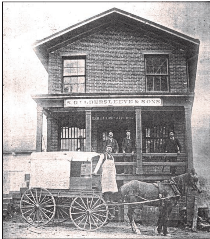
The Gildersleeve Store