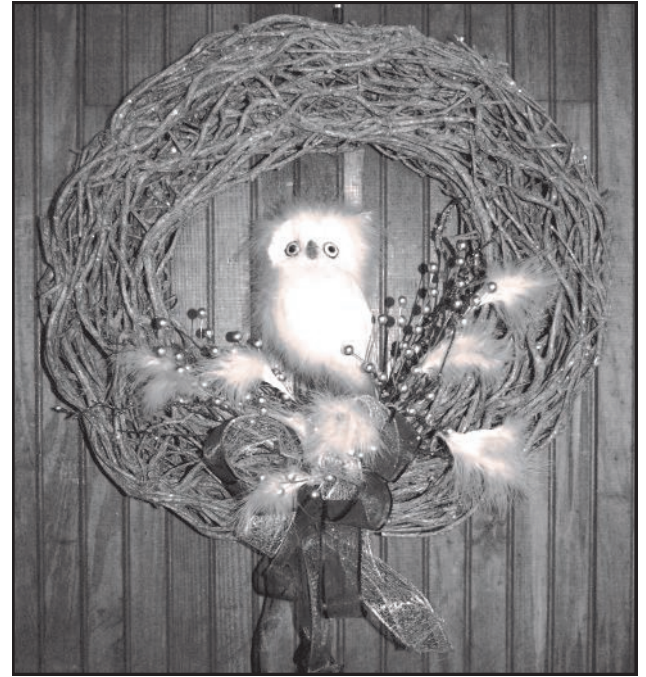
An imaginative Owl wreath from the 2012 Festival of Wreaths