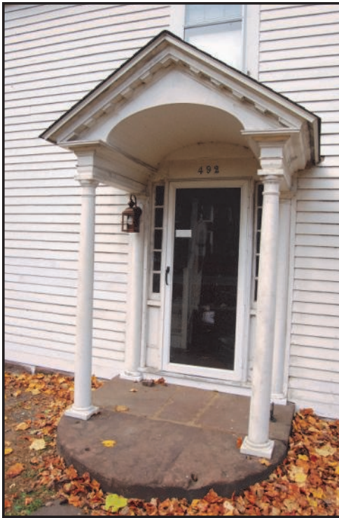
Front portico after repairs.

To address the necessary exterior carpentry repairs, we hired Jim Sarbaugh, an expert carpenter, and inci-