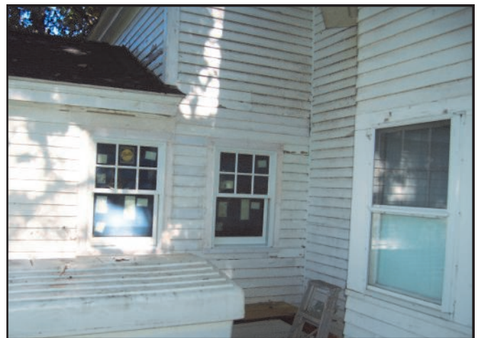
New kitchen windows have similar design and trim to original window (right).