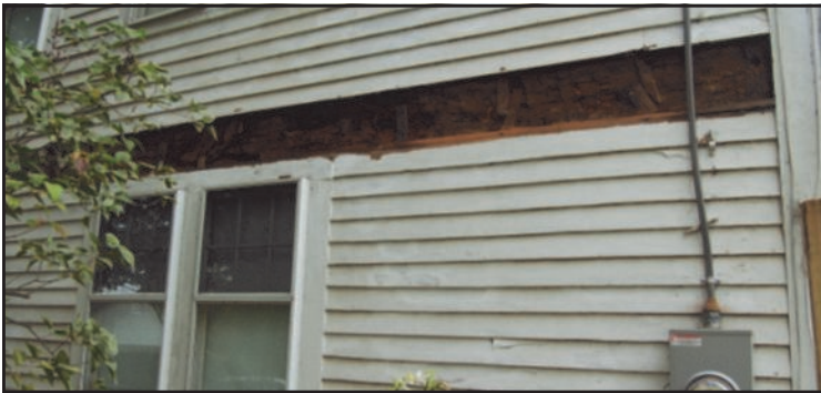
Repair work necessitated uncovering the south end girt - a large hand hewn beam from the original 1714 construction.

dentally, a member of the Society and the Greater Middletown Preservation Trust, to complete a long list of repairs. He began in mid July and by November 1 had completed all the work to the museum building. He will return to complete repairs on the garage building later.