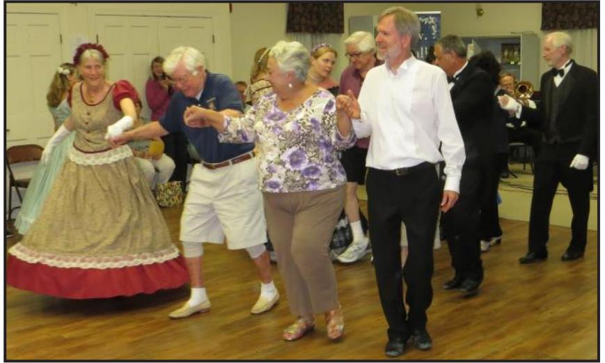
Society members join in the dancing at June's Ice Cream Social.

Dec. 14, 21, 28 and Jan. 4 - The Wonders of Toyland Before Electronics! Holdiay Exhibit at the Ruth Callander House Museum of Portland History - open 2-4 p.m.