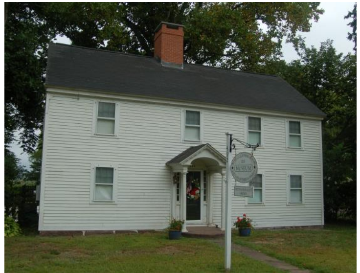
This photo of the Callander House shows the newly restored chimney with its blue-stone cap.

This fall our mason, Stan Bates, returned to complete repairs to the Callander House chimney. Much of the structure was 300 years old and many years of moisture coming down a cold chimney caused the bricks to disintegrate. As the single brick structure is not code for burning now, we elected to reconstruct the chimney historically with a flu liner for our furnace and appropriate protection at the top from future moisture. Stan deconstructed the old chimney down to a stable base just below the attic floor, then rebuilt it with new common brick to best match the old structure. He then sealed the unused flues and built piers topped with a blue-stone cap. We are very pleased to have a safe and secure structure, and functional flue for our furnace with the coming heating season.