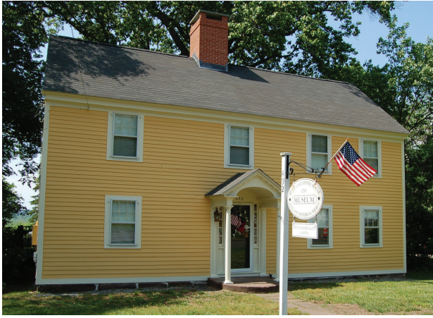
Ruth Callander House Museum of Portland History, 492 Main St., Portland, CT 06480, Tel: 860-342-5455